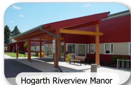
Hogarth Riverview Manor