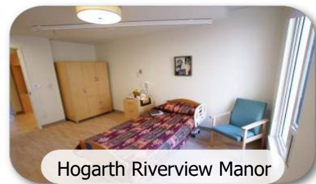
Hogarth Riverview Manor