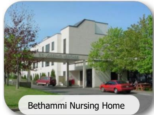
Bethammi Nursing Home

Bethammi Nursing Home is a 92-bed long-term care home operated out of St. Joseph's Heritage located at 63 Carrie Street. There are two Resident Home Areas (RHA). Bethammi Nursing Home has a mix of basic and preferred accommodations available for residents. All accommodations include a bathroom. All residents are provided with basic furnishings such as bed, night table, closet, vanity and dresser.