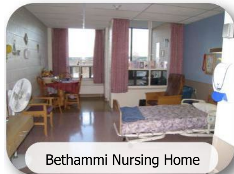
Bethammi Nursing Home

Hogarth Riverview Manor is a 544-bed long-term care home located at 300 Lillie Street N. There are 16 Resident Home Areas with 32 residents each. There is a selection of basic and preferred accommodations available. Private rooms have their own bathroom, while basic rooms share a bathroom between two rooms.